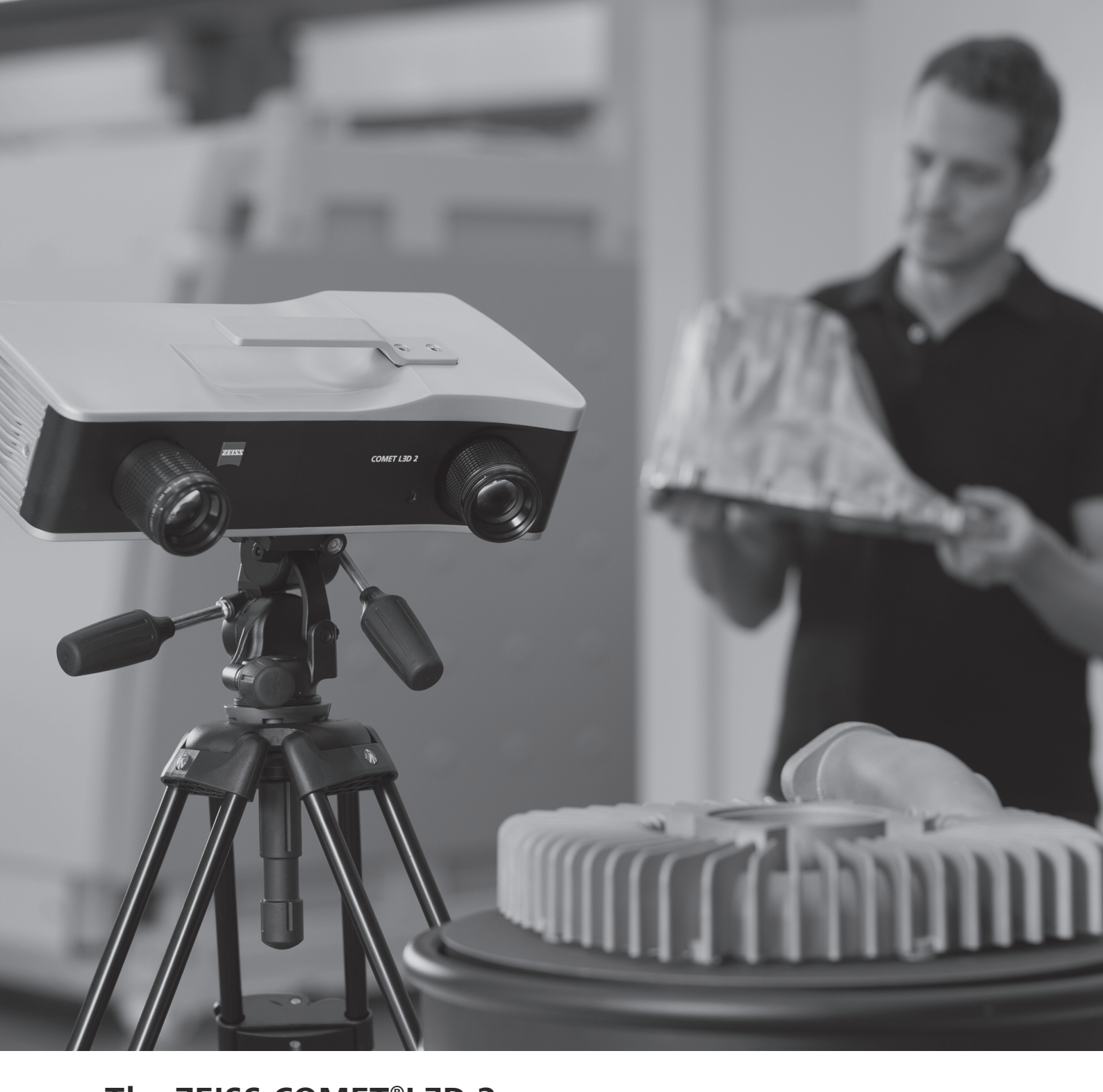
The ZEISS COMET®L3D 2

3D Scanning / Blue LED Fringe Projection