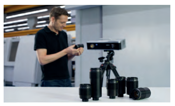
The right sensor for every application: Customize the measuring field (45 - 500 mm) quickly by simply changing the lens

The high-performance software platform colin3D ensures a consistently efficient and project-oriented procedure during the entire measuring process.