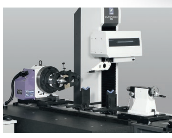
The SURFCOM C5 Type S: with additional rotary axis for measuring crankshafts and cam shafts